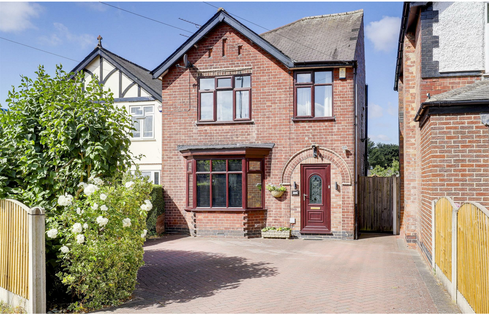
Pasture Road, Stapleford, Nottinghamshire NG9 8GP